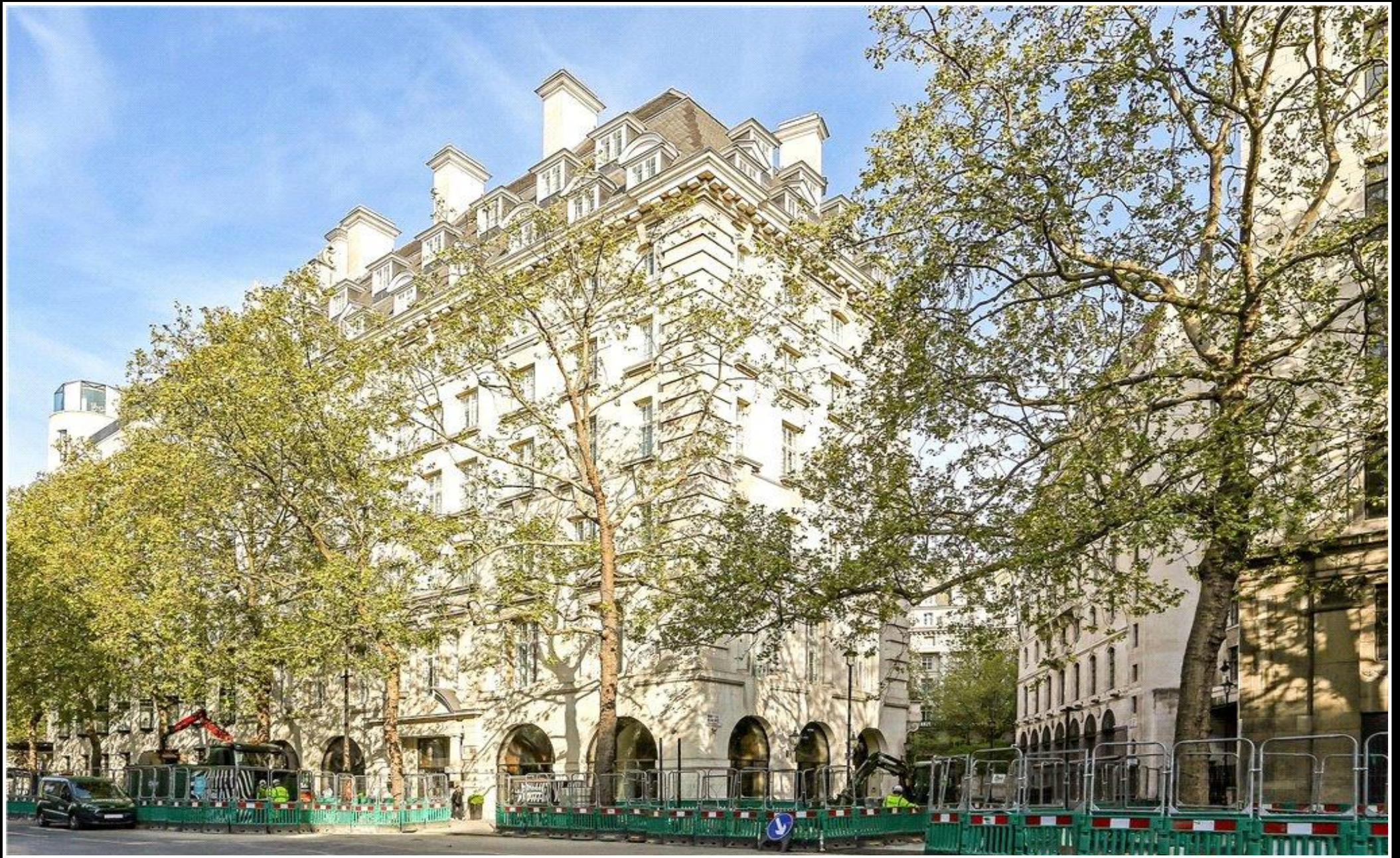
Marconi House, WC2R £1,025 p/w Furnished/Unfurnished